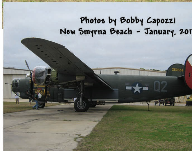
New Smyrna Beach - January, 201